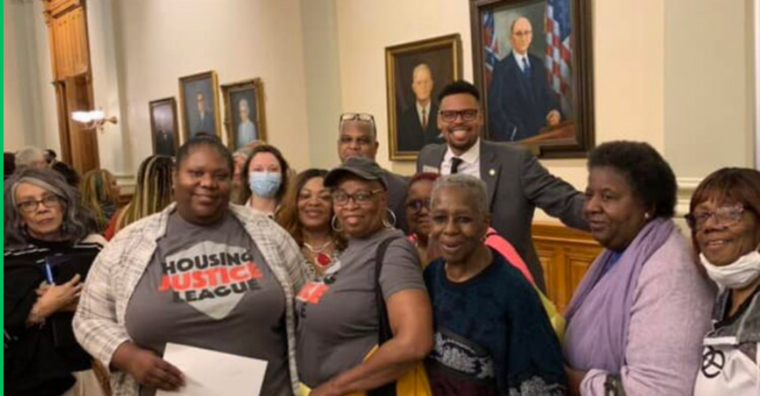
HJL joins Georgia ACT's Housing Day the Capitol

The bill also limits landlords from demanding a security deposit that exceeds two months' rent.