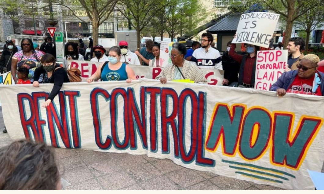
Organizers with HJL supporting rent control

We believe that everyone should have access to adequate, safe housing regardless of their ability to pay. We believe the people who are most impacted by housing insecurity and rent burden must lead the struggle against extraction by landowners and speculators.