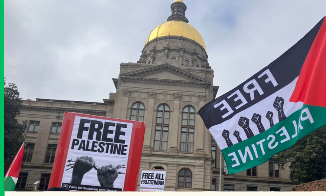
Organizers outside of the Georgia State Capitol Building during a rally for Palestine