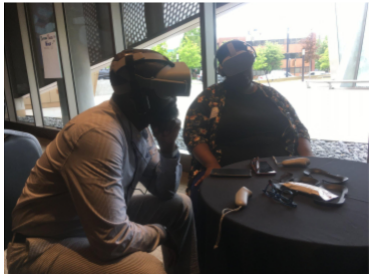
We watched a virtual reality experience about solitary confinement.